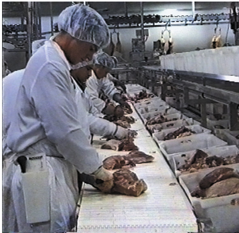
uni MPB C in D material

These conveyors are typically used to debone and cut meat. Workers cut directly on the belt