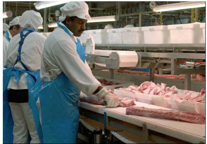
uni MPB C in D material